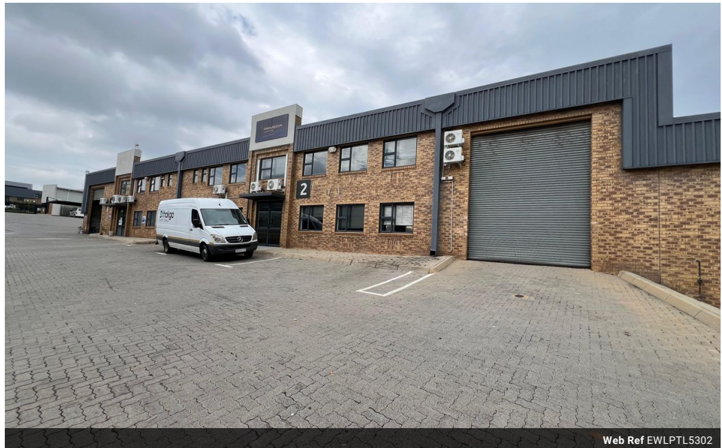
Web Ref EWLPTL5302

Office 40A Eden Meadows Complex 1 Van Riebeeck Avenue Greenstone 1609