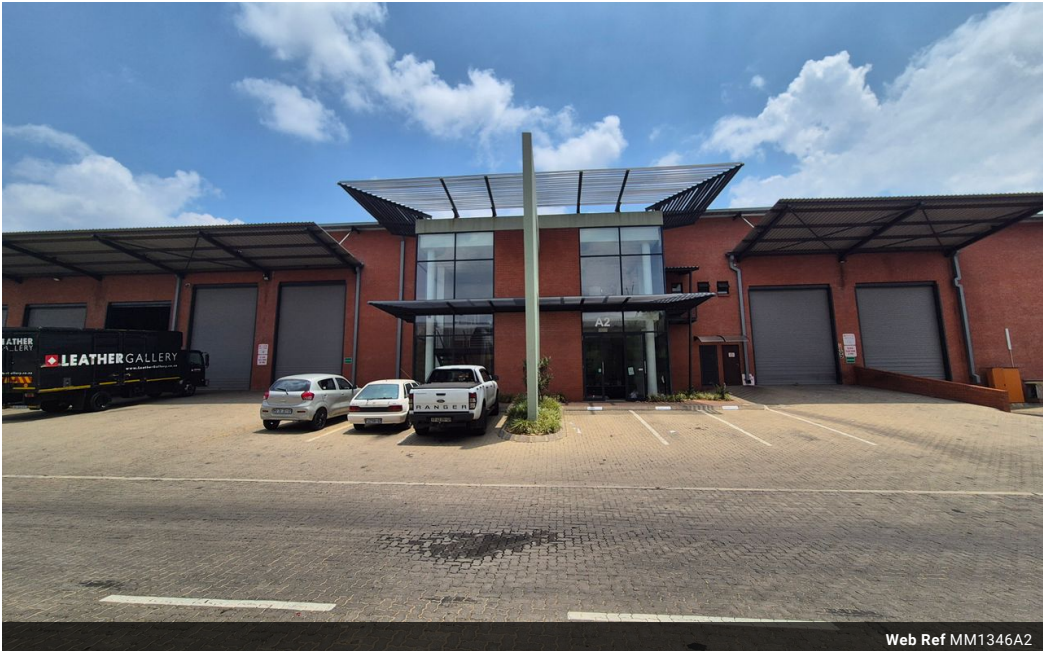
Web Ref MM1346A2

Office 40A Eden Meadows Complex 1 Van Riebeeck Avenue Greenstone 1609