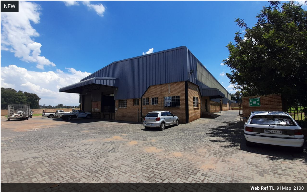
Web Ref TL_91Map_2100