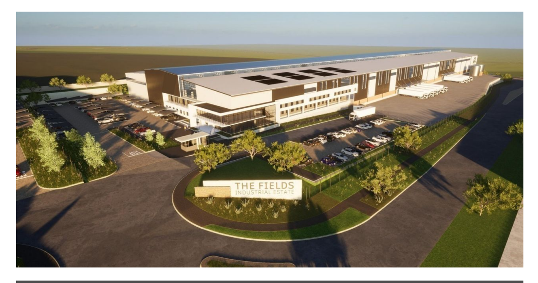
Web Ref CL13801