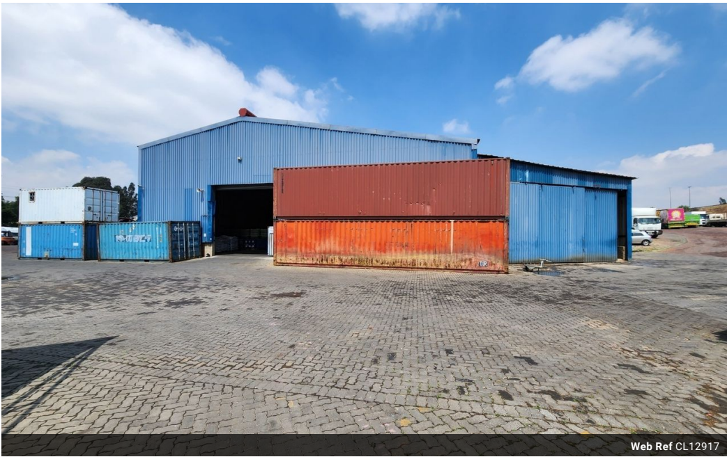
Web Ref CL12917

Office 40A Eden Meadows Complex 1 Van Riebeeck Avenue Greenstone 1609