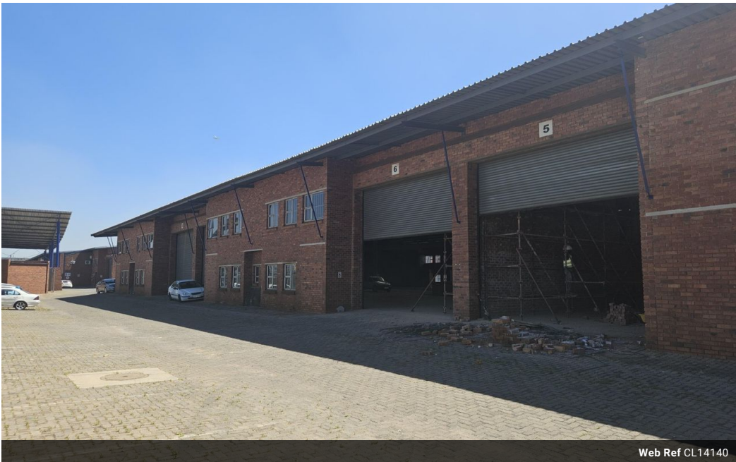
Web Ref CL14140

Office 40A Eden Meadows Complex 1 Van Riebeeck Avenue Greenstone 1609