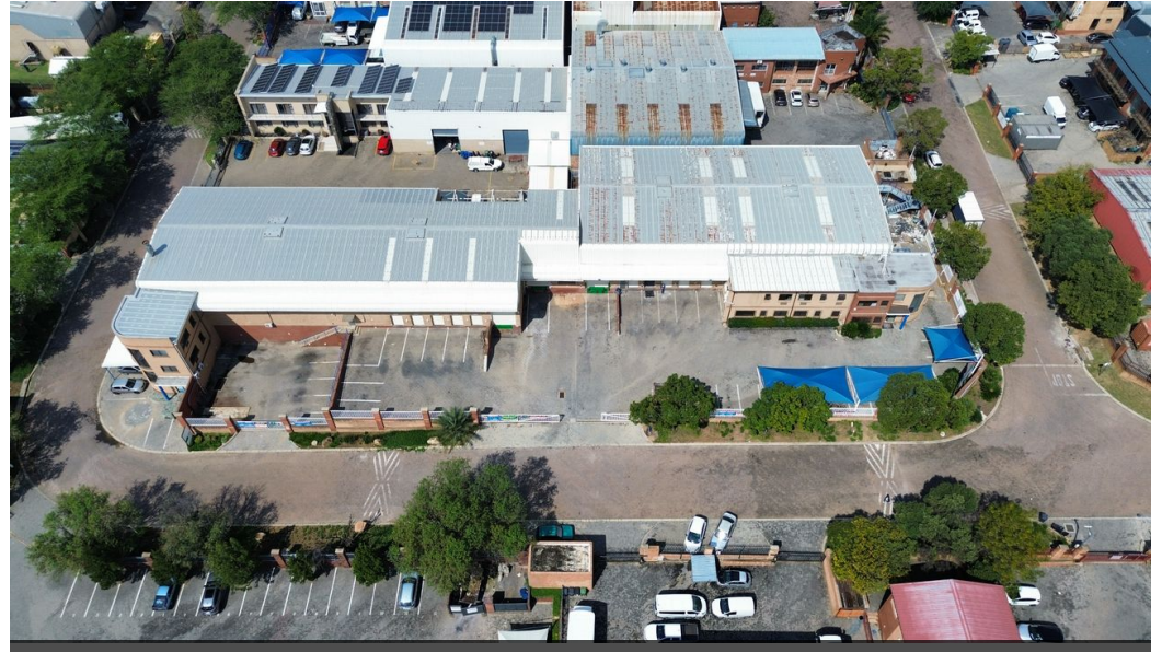
Web Ref MM2840FSNBF

Offers for this listing must be made in R100,000 increments