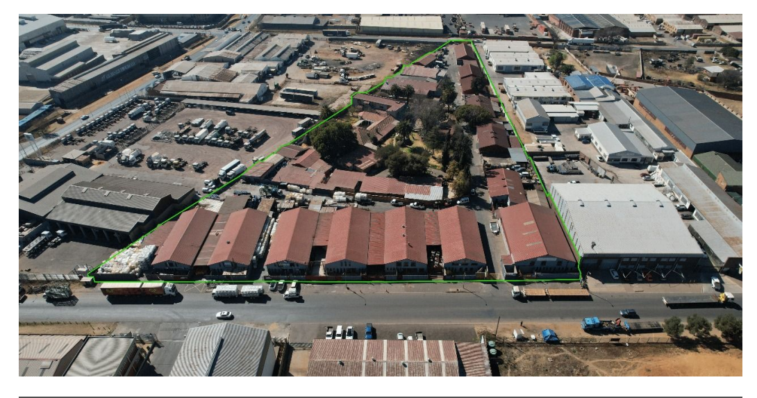
Web Ref CL13380