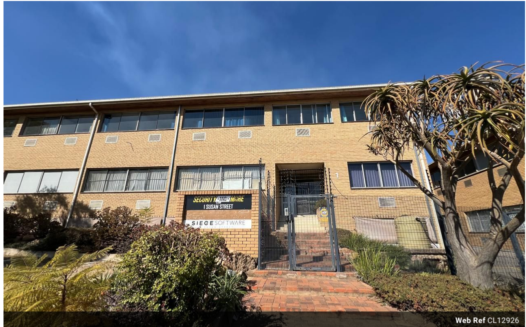
Web Ref CL12926

Office 40A Eden Meadows Complex 1 Van Riebeeck Avenue Greenstone 1609